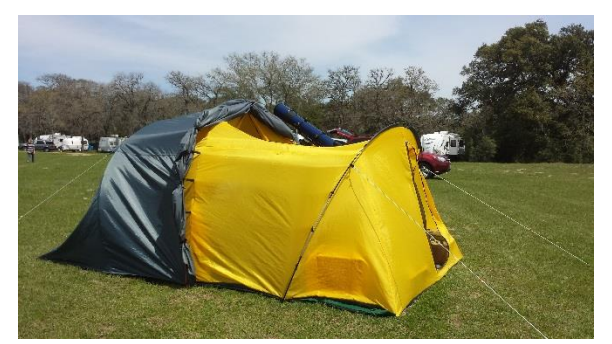
150mm f/8 SkyWatcher on Losmandy G-11 mount and tripod at Houston Astronomical Observing Site 80 miles west of Houston, Texas.

As you can see in the image to the left, I have setup the 150mm f/8 SkyWatcher Refractor on top of the Losmandy G-11 mount and field tripod in the center of the observing portal. The observing section and portal will easily accommodate a Fork Mounted C-14 or larger SCT. The footprint of my Celestron C-14/C-11 Wedge is not that much larger than the Losmandy G-11 mount. A larger Newtonian OTA with a tube length 60 to 70 inches would also be at home in the Stargate II tent. I had no problem moving around the telescope to view objects at the horizon and/or zenith. While I was aware of what was at my feet, I had plenty of room to maneuver. I never felt cramped or closed in and I wasn't tripping over my gear and/or power cords. 2 to 3 people could be in the observing section and not trip over each other. In the sleeping/warm room area, I was more than comfortable. My wife. Vicky could have been in her sleeping bag next to me and we would still have had ample room to be comfortable.