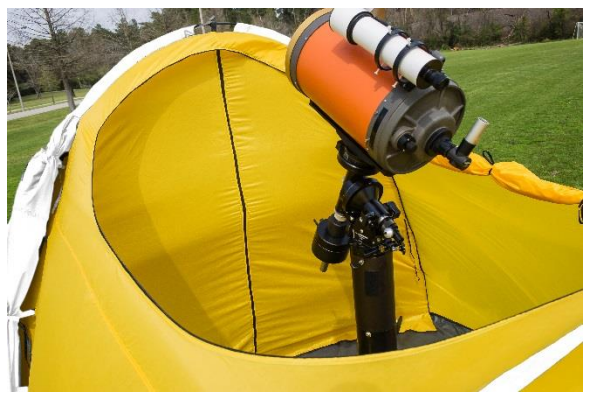
View of observing portal opened for viewing session...lots of room!

Even though the OTA is over 52 inches, when I am viewing at or near the horizon and say 30 degrees above, I have plenty of room along in the observing portal to observe through the eyepiece. The observing portal more than accommodates this OTA length plus me inside the walls of the tent.