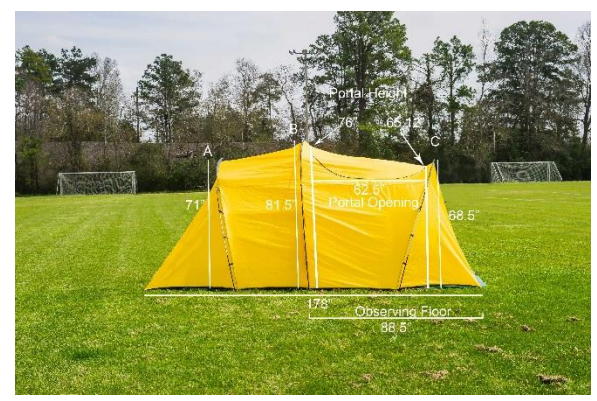
Side view of the Stargate II Tent showing length and height of tent and side dimension of portal window.

I liked the size, color and appearance of the tent from the start.