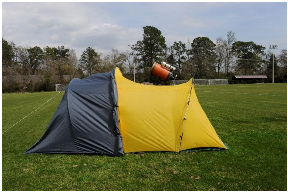
C-11 mounted up on Losmandy G-11 mount and ready to observe at alocal County Park.

Obviously, I will have more room to view when I use the C-11 and FC-100 OTA's.