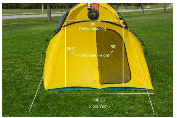
End view of Stargate II Tent showing the width of the tent and the width of the observing portal opening.

The doors are large enough to carry the Losmandy G-11 field tripod into the observing section with the 12 inch extension and the tripod legs mounted and extend to my observing height for all three of my OTA's (C-11, 150mm SkyWatcher f/8 refractor and Takahashi FC-100 f/8 refractor). Remember to place protective pads under tripod legs to protect tent floor material from abrasion.