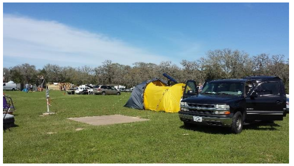
Houston Astronomical Society Observing Site 80 miles west of Houston.

permitting (which it didn't) and I brought everything including the kitchen sink I thought I might need or use. All that stuff ended up in the tent. In the observing room, I had my Losmandy G-11 mount/field tripod/Gemini 1 Level 4 controller and the telescope that I planned on using (either a C-11, 150mm StarWatcher Refractor or my Takahashi FC-100 Refractor). Around the perimeter of the observing area of the tent, I had 4 plastic tool/fishing boxes that house my eyepieces, adapters, etc. a box of food, two boxes of electrical gear, two 12V power supplies, small camp stove, ice chest, camp potty (sometimes tough to walk 300 yards to the Latrine (2) and pneumatic observing stool. In the warm room area (sleeping bay) I had. backpacking sleeping pads, sleeping bag, pillows, extra clothes bag, jackets, and camping table (5' by 2") that had 3 laptop computers and a storage box on the top of the table. Under the table I had three large backpack style camera bags with cameras and astronomical gear. To give you an idea of the volume of space this actually takes up, consider a full size Chevy Suburban with the center seat folded down flat and the third seat folded over forward. The volume from the third seat to the back door is 80 cubic feet. That 80 cubic feet contained all of my gear. I put all that volume in the Stargate Il tent with lots of room left to walk around